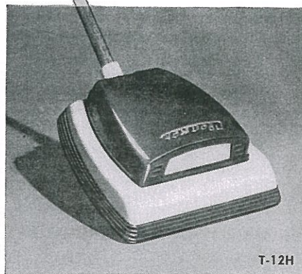
T12-H—VACUUM CLEANER by Wagner (4-10 years). Really efficient household helper. Rotating brush picks up dust, etc. Metal; 24" wooden handle with rubber grip; rubber wheels, on-off switch. Brown and maroon. 8" x 9". Battery operated. 3.98 T12-H-100 —Batteries extra, 3 for 60¢