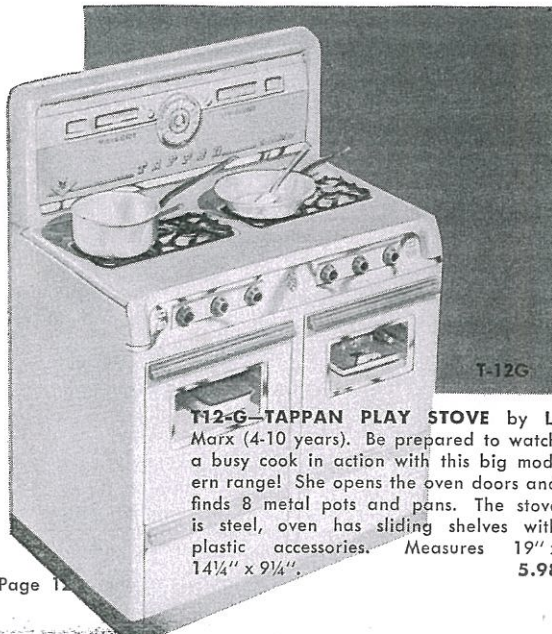
T12-G—TAPPAN PLAY STOVE by L. Marx (4-10 years). Be prepared to watch a busy cook in action with this big modern range! She opens the oven doors and finds 8 metal pots and pans. The stove is steel, oven has sliding shelves with plastic accessories. Measures 19" x 14 \frac{1}{4} " x 9 \frac{1}{4} ". 5.98