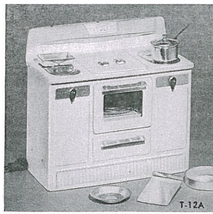
T12-A—LITTLE LADY ELECTRIC RANGE (6-12 years). Insulated oven's thermostat retains perfect baking temperature automatically. Two burners, two lights. Cord, utensils, cook book. Decorator Coral with white; 15" x 13 \frac{3}{4} " x 7 \frac{1}{2} ". It's UL approved, and tested for extra safety. 15.98 T-12-B —12 \frac{1}{2} " x 11 \frac{1}{8} " x 7" size. 9.98