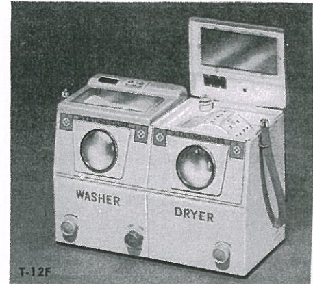
T12-F—COMBINATION WASHER-DRYER by Wagner (4-10 years). Put in water, soap and clothes and watch agitator action through window. Tumbler-action dryer has vent, washer has a drain hose. 9" long pair. Battery operated. 3.98 T12-F-100 —Batteries extra, 2 for 40¢