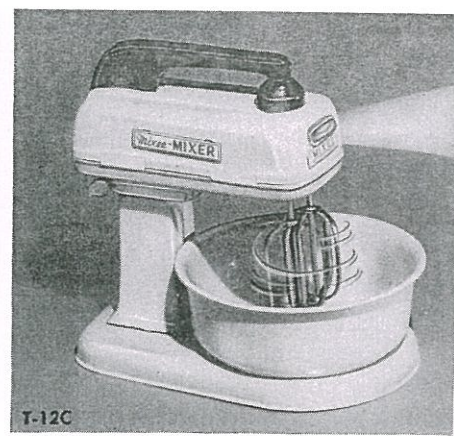
T12-C—MIXEE MIXER by Wagner (4-10 years). Just like Mom's! It mixes and blends cake batters, frostings and other goodies in 5 \frac{1}{4} " bowl or as hand mixer. The beaters are safe to touch, even when spinning. Has shiny red light. 7 \frac{1}{4} " x 4 \frac{1}{2} " x 6 \frac{1}{4} ". 2.98 T12-C-200 —Batteries extra, 2 for 40¢