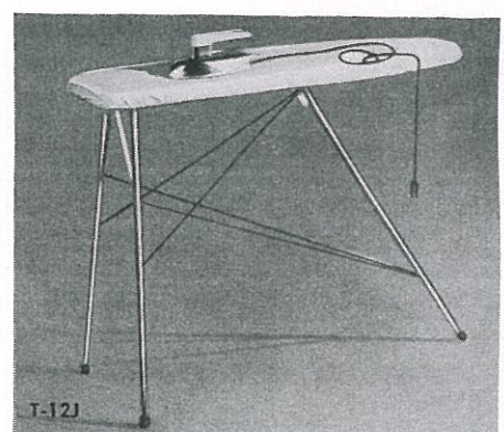
T12-J—AMC ELECTRIC IRONING SET (4-12 years). UL approved 7" chrome-plated iron won't overheat. She can open and close the sturdy steel board with one easy move... it stands 22" high and is pink enameled. Heavy pad; Pink-edge cloth cover included. 4.98